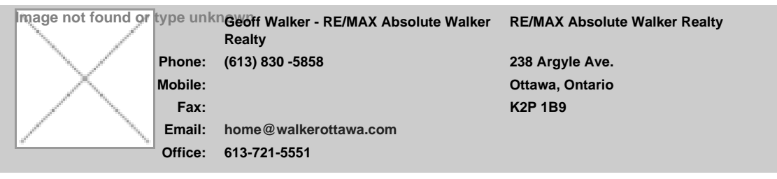
205 Casa Grande Circle, Ottawa, Ontario, K4A 1A2, Canada